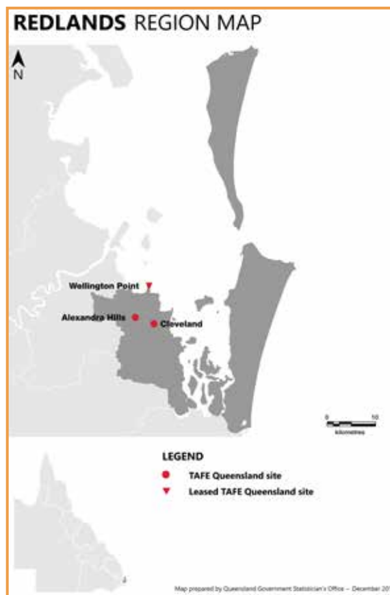
This map is intended for general reference use only

Enrolments in construction courses have doubled in the last three years, with over 500 students enrolled in 2017-2018. Other key areas of delivery include engineering, general education, and health. Enrolments are projected to increase over the 10 years to 2027.