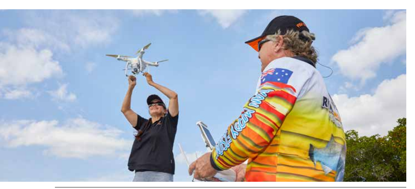
2 Jobs Queensland, Anticipating Future Skills: Jobs growth and alternate future for Queensland to 2022, and the Future of Work in Queensland to 2030 – Evolution or revolution, discussion paper.

We will broaden our approach to training in recognition that skills development extends beyond formal qualifications and must cater to the needs of a more dynamic and diverse labour market and economy.