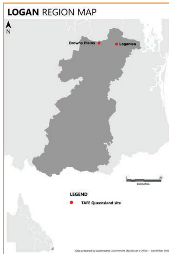
This map is intended for general reference use only

Student training enrolments in the Logan region are projected to significantly increase over the 10 years to 2027.