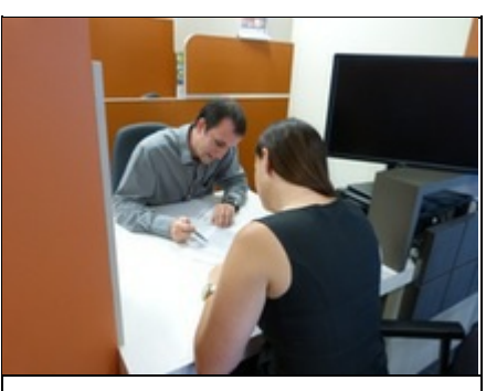
Attachment type Workplace photo Customer Interac. 6.2MiB