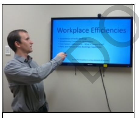
Attachment type Workplace photo