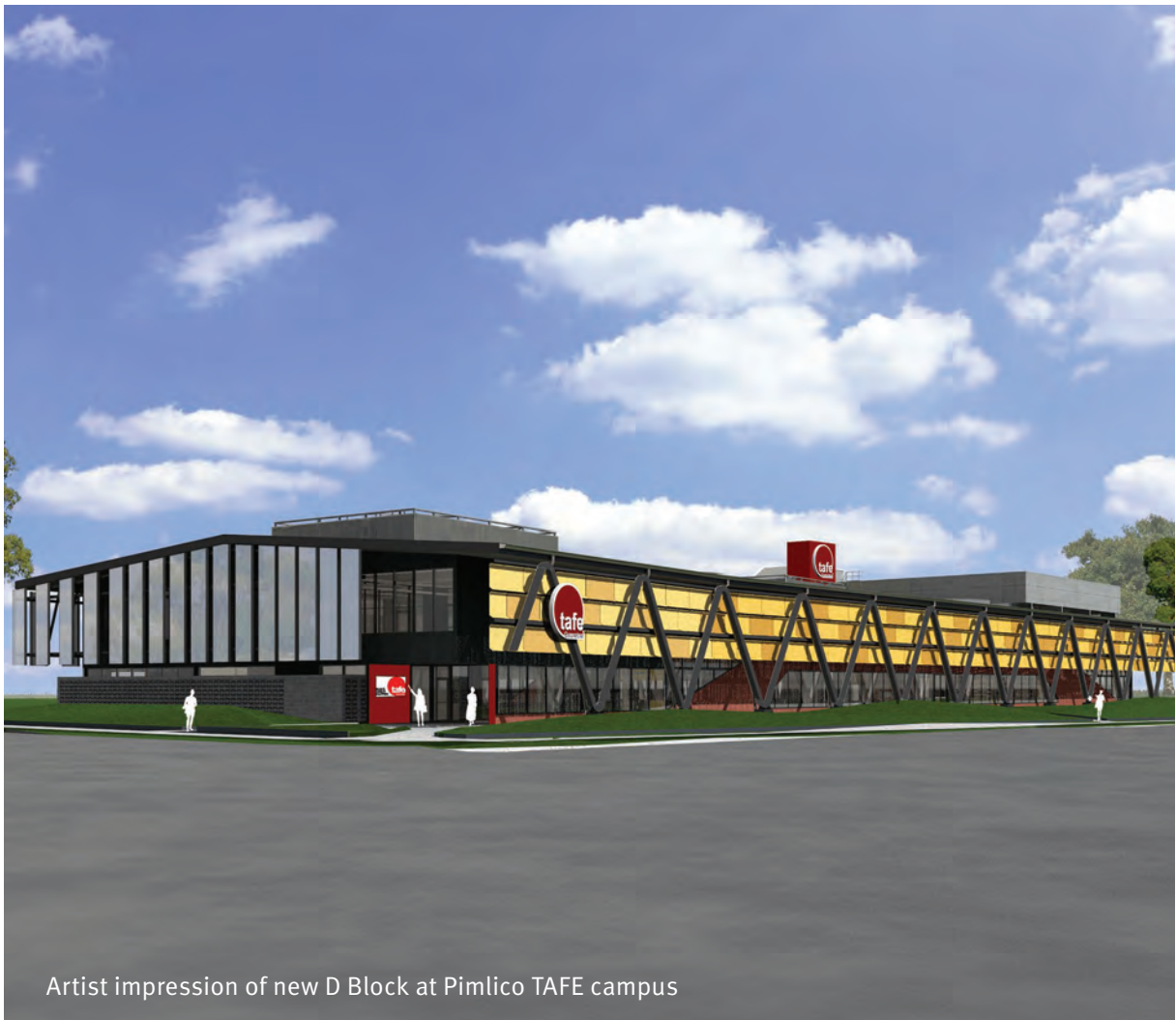
Artist impression of new D Block at Pimlico TAFE campus

The site will continue to provide non-trade training with a focus on general education and training, community services, hospitality, cookery, hair and beauty, and health, reflective of the growth industries in Townsville city area.