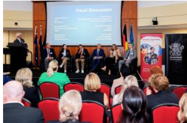
Image: Special guests and panelists at the recent Queensland Launch of National Skills Week.