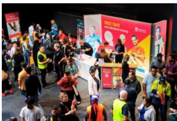
Image: Queensland Jobs and Skills on show at the Logan-based Multicultural Career and Job Expo.

To learn more about free and subsidised training, visit qld.gov.au/skillspower .