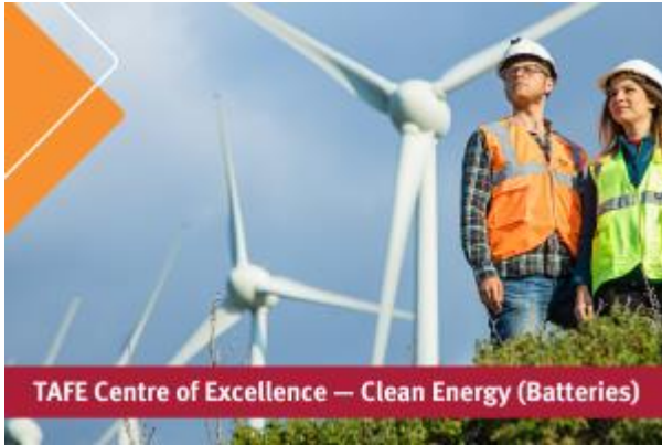
TAFE Centre of Excellence — Clean Energy (Batteries)

The centre, which will be coordinated from TAFE Queensland's SkillsTech campuses, will not only supply the skills for the clean energy industry, but also positions Queenslanders for employment in the rapidly evolving energy landscape.